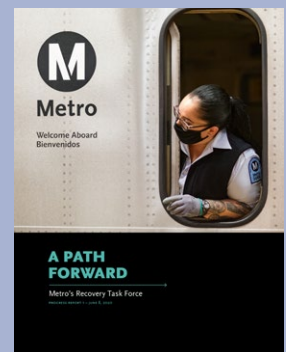
Recovery Task Force Reports