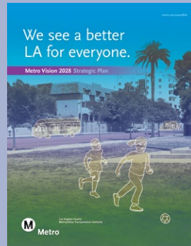
Vision 2028 Strategic Plan

Learn more about Metro's current initiatives and projects: