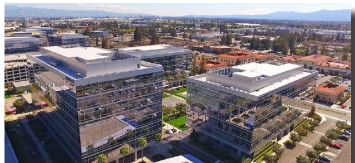
Santa Clara Square is a very successful combination of office, residential and retail uses that has attracted new businesses to Santa Clara.

The ideal candidate will be a proven professional who enjoys working for a community with a high level of development. Individuals should be comfortable working with the high level of activity, have a strong commitment to the fair and ethical administration of regulations, the ability to maintain morale, and have a reputation for fostering a positive teamwork environment. Strong candidates will be knowledgeable of the building code, have good judgement on how to apply the code, resolve problems and work with people inside and outside of their organization. The ideal candidate should also: