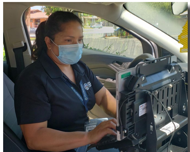
The Santa Clara Building Division rapidly implemented safety protocols and technology tools at the onset of the Covid-19 outbreak that allowed the City to provide a full range of plan check and inspection services without interruption,

The City Manager, City Attorney, and City Auditor are appointed by the City Council. The City Manager is the Chief Executive Officer for the City, Silicon Valley Power, Stadium Authority, and the appointing authority of employees. The City's total workforce is 1,150.75 FTEs and the 2020-21 fiscal year budget is $1.028 billion with $342.1 million in Capital Improvement Projects. In addition to the general municipal services conventionally provided by a local government, Santa Clara operates three additional lines of public service, either through a DBA or separate Joint Powers Authority (JPA) public agency: (1) a municipal electric utility doing business as, Silicon Valley Power; (2) Santa Clara Stadium Authority, the Joint Powers Agency charged with oversight of the Levi's Stadium; and, (3) Santa Clara Convention Center, a city-owned facility operated by a third party management agreement with tourism attraction services supported by a Tourism Improvement District. Combined, the annual