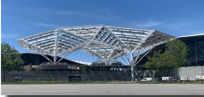
NVIDIA Headquarters Building – Phase 2 under construction