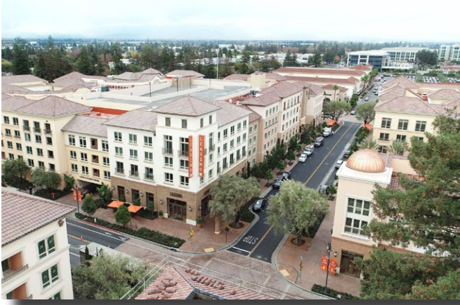
A recently completed example of mixed-use residential development underway in Santa Clara