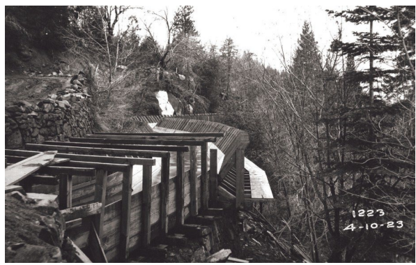
Flume under construction in 1923

Additionally, we have a repayment contract with the Bureau and exercise District consumptive water rights associated with Project 184 and historical agricultural activities for diversion from Folsom Lake to meet growing municipal and industrial demands of the region.