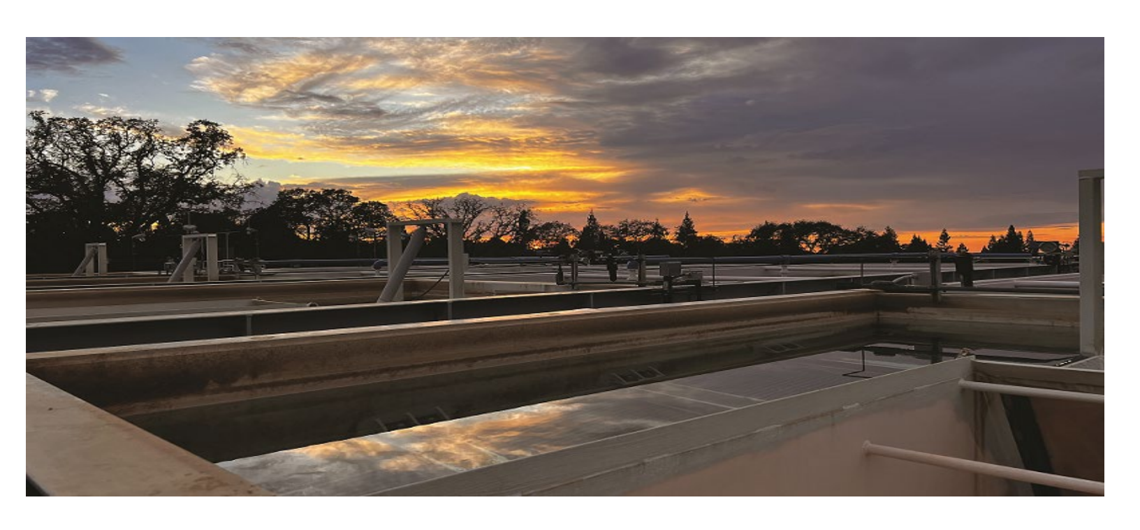
EID seeks a Water Treatment Supervisor