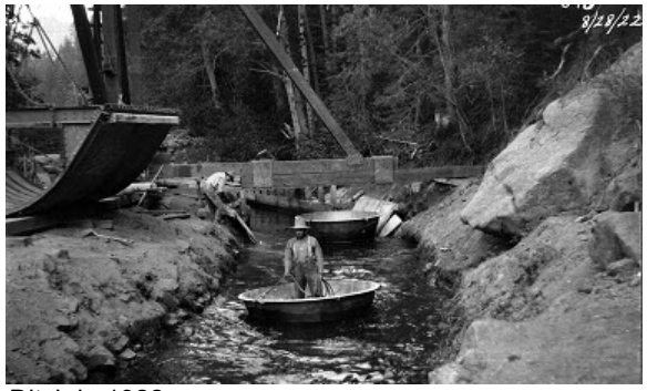
Ditch in 1922

Welcome to El Dorado County where lifestyle amenities are many and an exciting position awaits the right candidate at the El Dorado Irrigation District (District/EID).